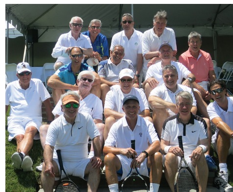
Tennis aces played at Nassau Country Club.